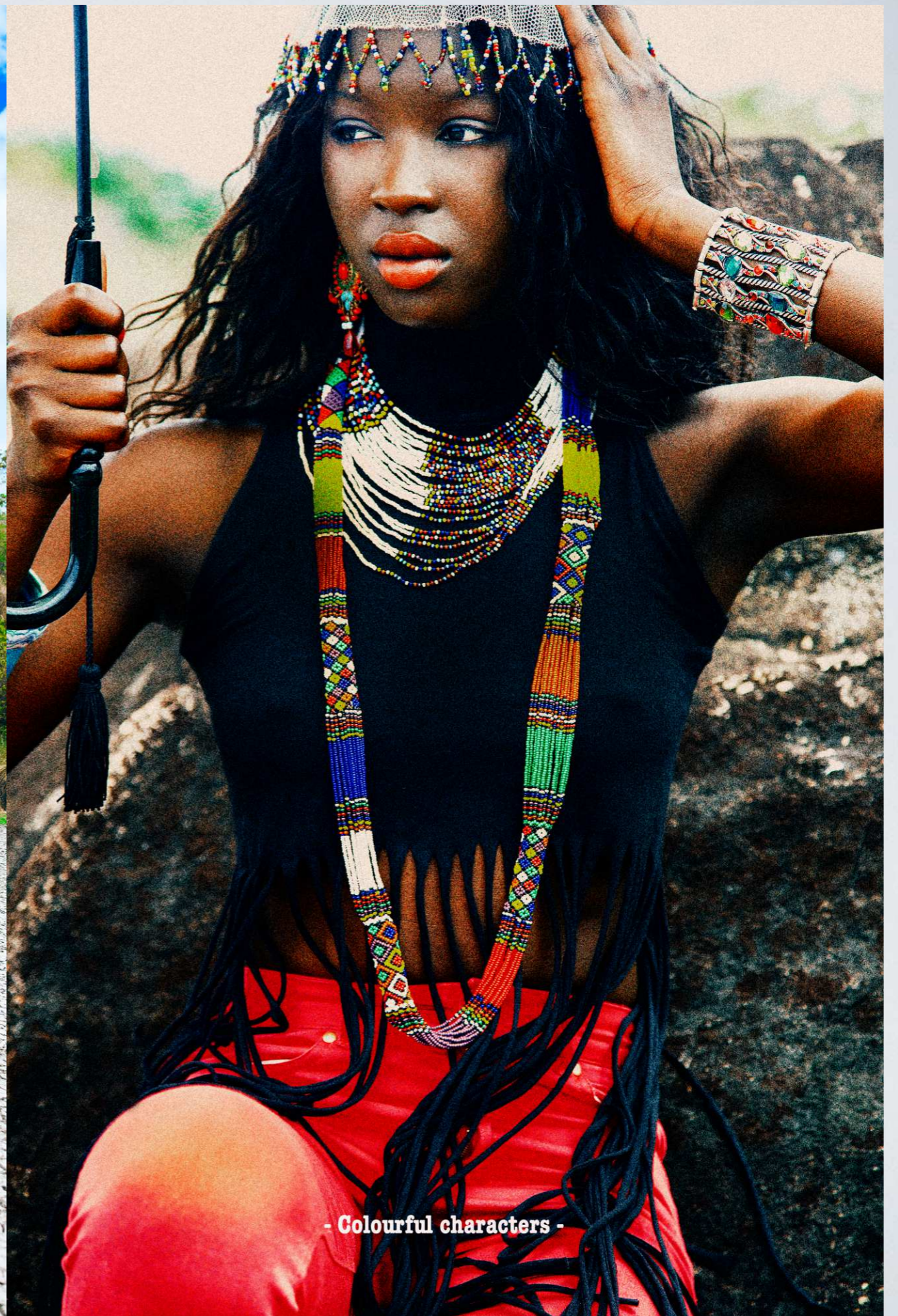
- Colourful characters -