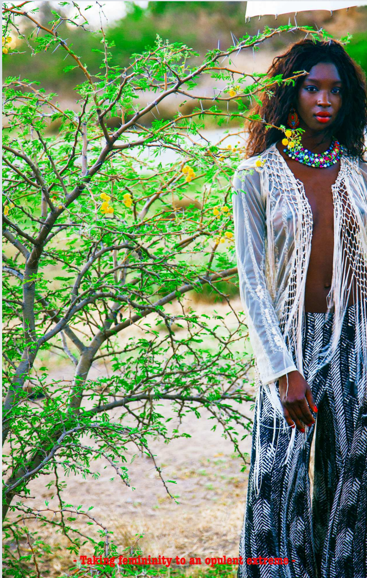
- Taking femininity to an opulent extreme -