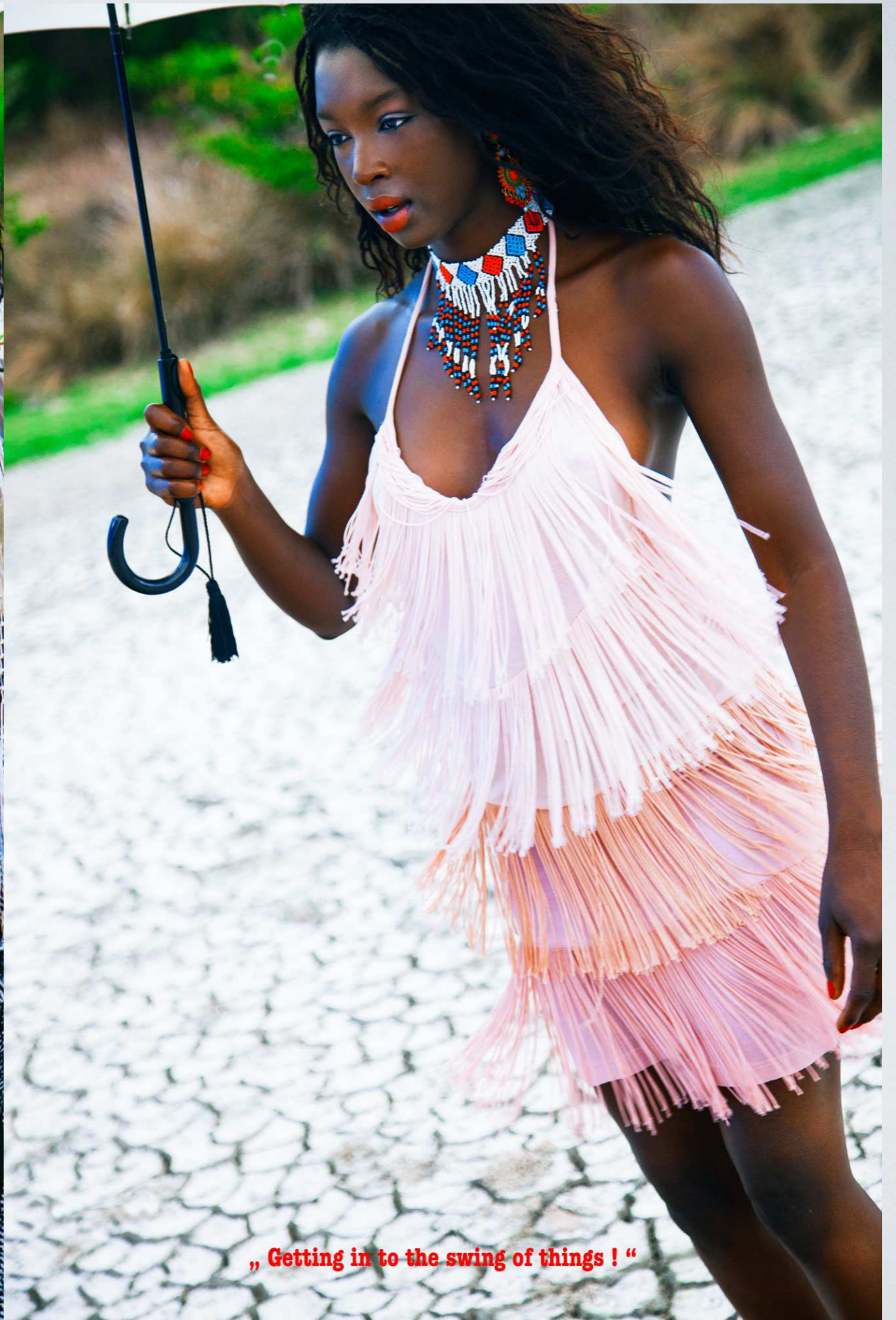
„ Getting in to the swing of things ! “