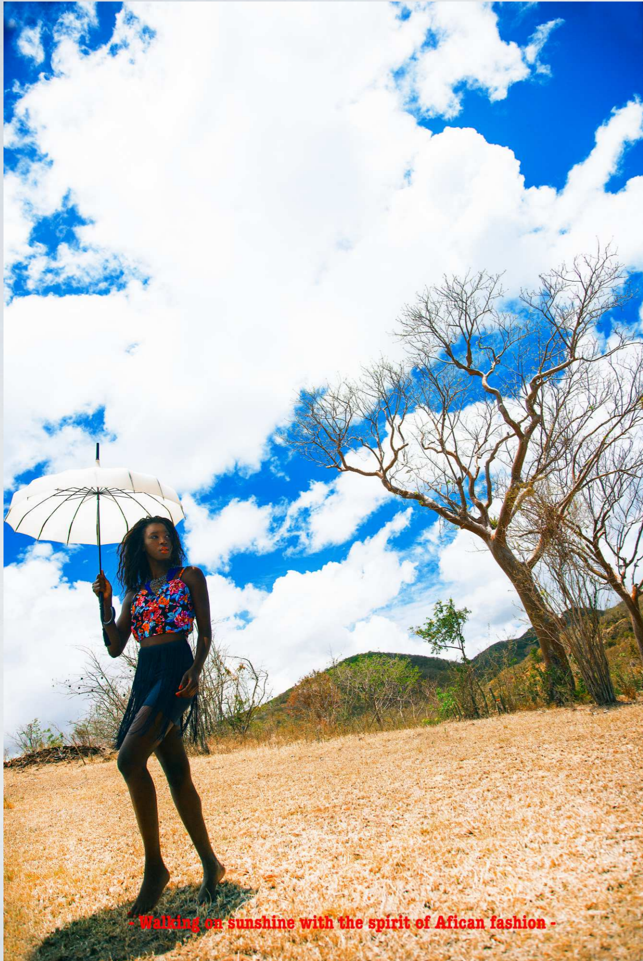
- Walking on sunshine with the spirit of African fashion -