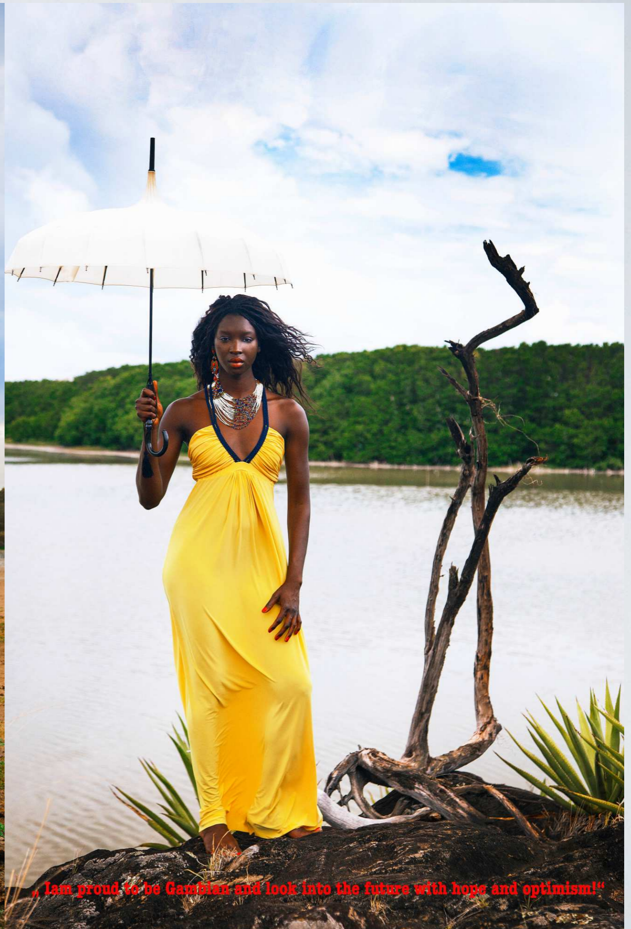
„I am proud to be Gambian and look into the future with hope and optimism!“