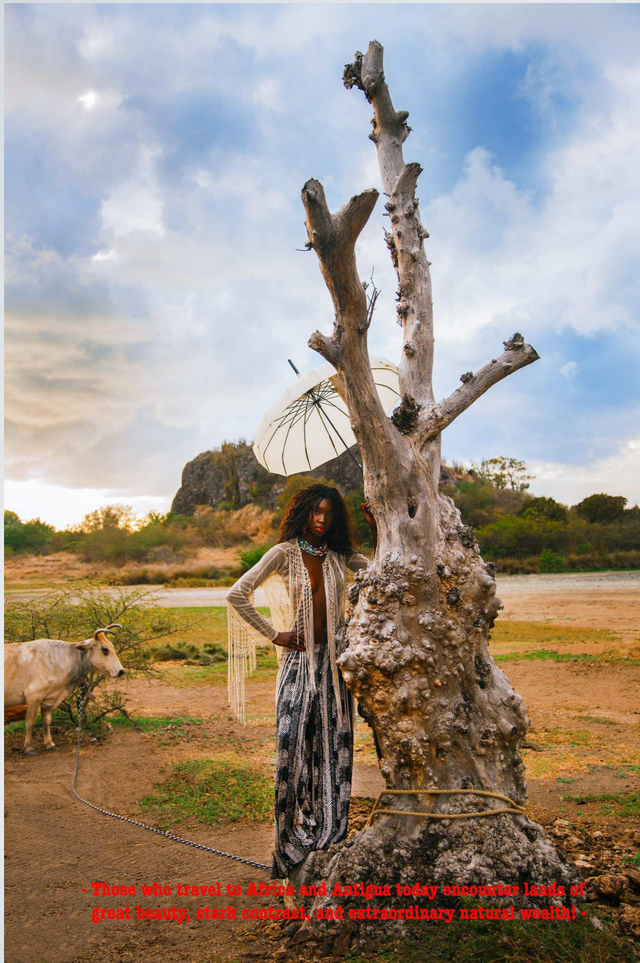
- Those who travel to Africa and Antigua today encounter lands of great beauty, stark contrast, and extraordinary natural wealth! -