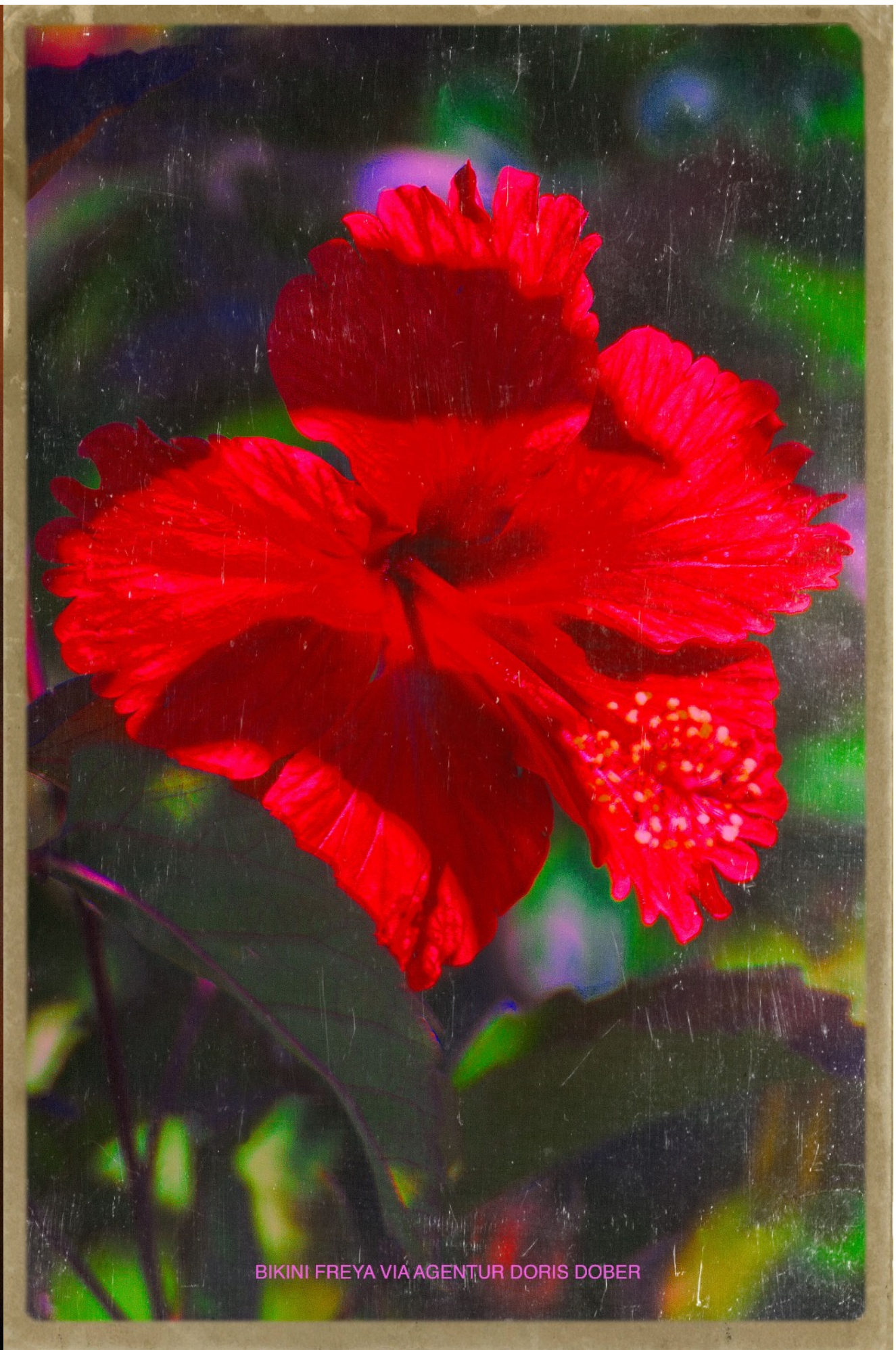
BIKINI FREYA