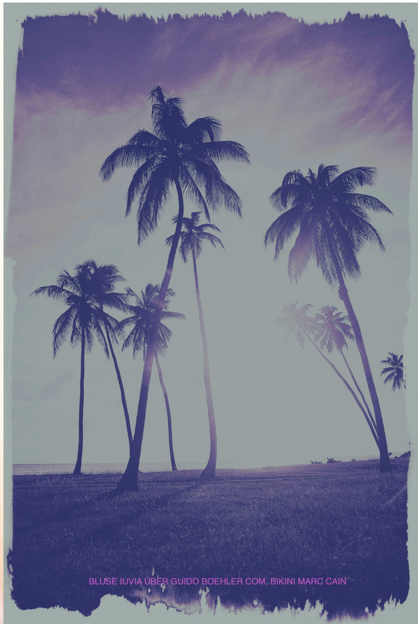
BLUSE IUVIA ÜBER GUIDO BOEHLER COM, BIKINI MARG CAIN