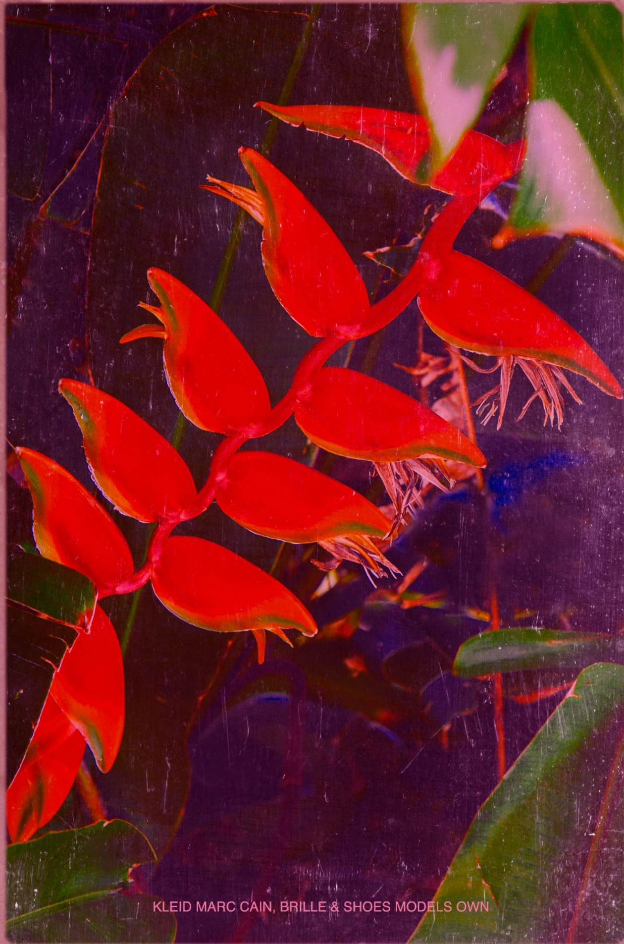
KLEID MARC CAIN, BRILLE & SHOES MODELS OWN