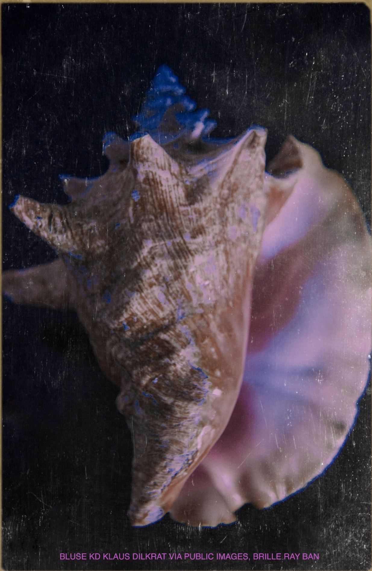
BLUSE KD KLAUS DILKRAT VIA PUBLIC IMAGES, BRILLE RAY BAN